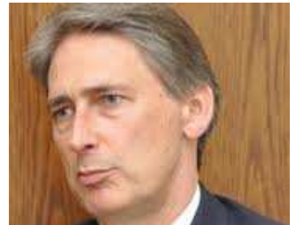
Philip Hammond Secretary of State for Transport

port, all action groups should contact their local MP and arrange for Philip Hammond to both visit their area and meet with residents.