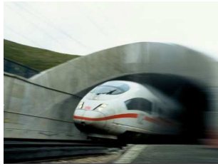
Properties close to tunnel entrance/exits are now included